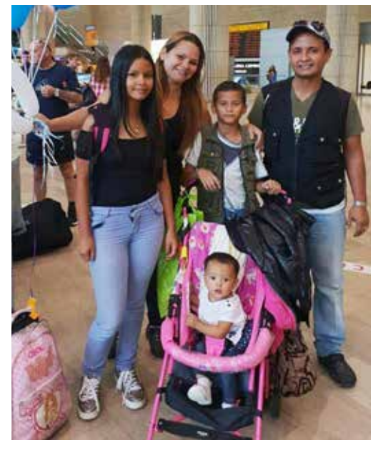
Three of the families who have braved the dangers to go to Israel.

Please pray for our team as they give their time and energy to help the Jewish people safely reach Israel, their true homeland.