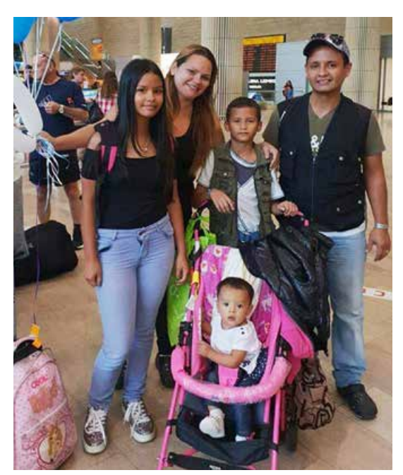
Three of the families who have braved the dangers to go to Israel.