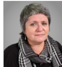
ELYA VASYUKOVA MOSCOW LEADER