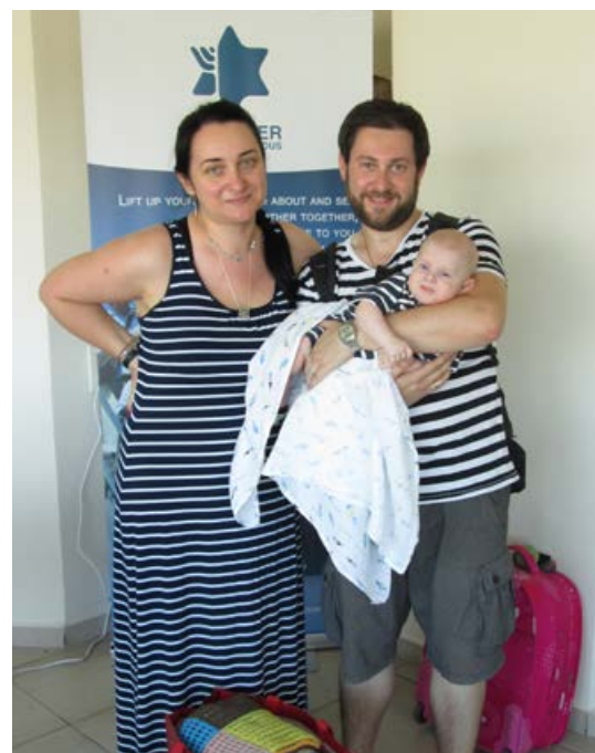
Top: A young family arriving at Ben Gurion on route from Moscow to their new life in Israel.

We long to see God's promises come to pass for His people. "For I know the plans I have for you," declares the Lord, 'plans to prosper you and not to harm you, plans to give you hope and a future'" (Jeremiah 29:11).