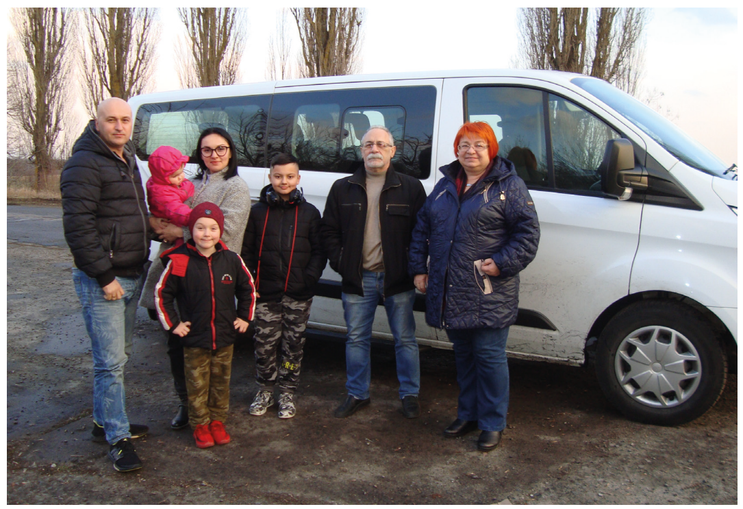
The long journey resulted in the best possible outcome for the families!