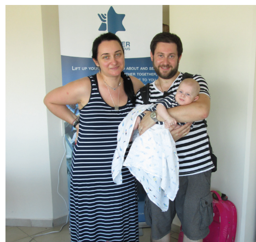
Top: A young family arriving at Ben Gurion on route from Moscow to their new life in Israel.

We long to see God's promises come to pass for His people. "For I know the plans I have for you," declares the Lord, 'plans to prosper you and not to harm you, plans to give you hope and a future'" (Jeremiah 29:11).