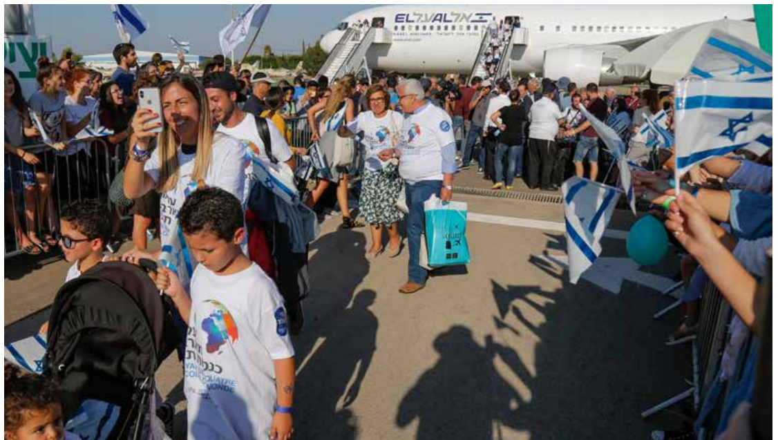
Aliyah flight arrival Ben Gurion Airport, Israel.

Will you answer the Father's call? Will you be that voice in your area? Please pray and seek the LORD as to what your part is in this holy work of Aliyah. We covet your partnership to help us fulfill God's call and mandate to assist, encourage and bless our Jewish brothers and sisters. The Lord God will bless you as you honor Him and bless His people.