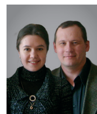
PAVEL & LINA MOLDOVA LEADERS