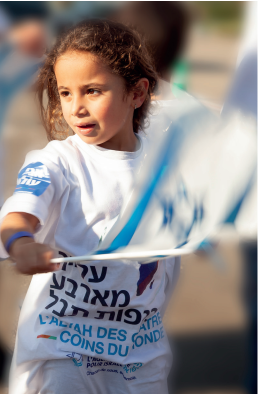
David Ben Gurion reading the Declaration of the Independence of Israel in the museum in Tel Aviv. A young French Jewish girl happy to be in Israel.