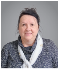
YANYA UKRAINE REPRESENTATIVE