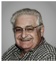
STEVE LIGHTLE INTERNATIONAL SPEAKER & AUTHOR

"Now it shall come to pass in the latter days that the mountain of the Lord's house shall be established on the top of the mountains, and shall be exalted above the hills; and peoples shall flow to it." Micah 4:1 NKJV