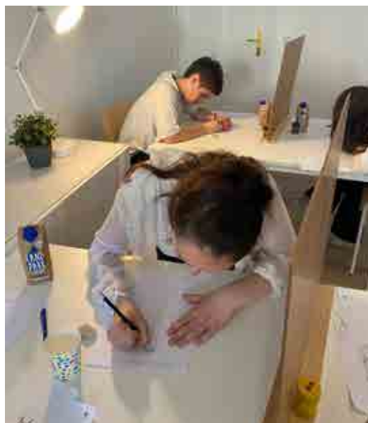
Top & Left: Student screening at the IPC in Berlin.