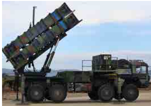
Top: Hamas night attack on Ashdod.

Let us all earnestly seek the Lord and ask Him to show us how to pray effectively for Israel and our own nations. "The Lord is my rock and my fortress and my deliverer; my God, my strength, in whom I will trust ..." (Psalm 18:2).