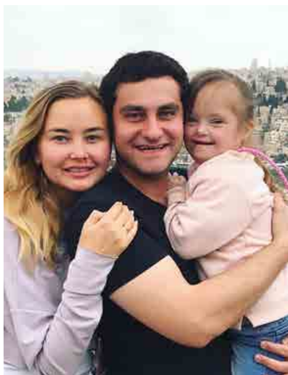
Left: A young family who made aliyah from Perm in Russia.

Klita concerns the absorption of olim after they have arrived in Israel. It includes all aspects of integrating into society, including learning Hebrew, finding employment and housing, school enrolment and serving in the Israel Defense Forces (IDF).