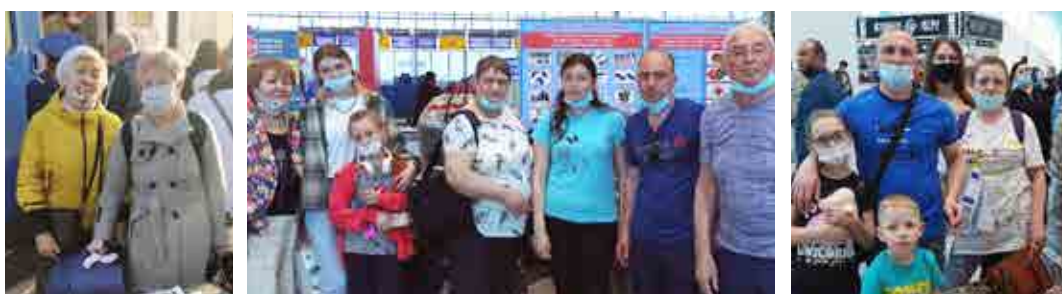
Top: Korean believers who helped transport olim to the airport