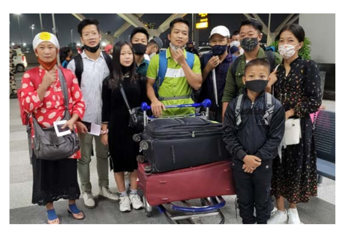
Right: Bnei Menashe Olim at New Delhi airport.

In a number of places shub can also mean "return from exile". That is precisely the very sense the prophet Isaiah wanted to convey when he solemnly declared in Isaiah 42:22 that "No one says 'Restore'". In other words, it is as if Isaiah was saying "there is no one to commend restoration. None is interested in the prophetic importance of the restoration of the Jews to their own Promised Land. No one can speak words of comfort and relief. Had it not been for the faithfulness of the Lord, where would they be now?" What a situation that would be!