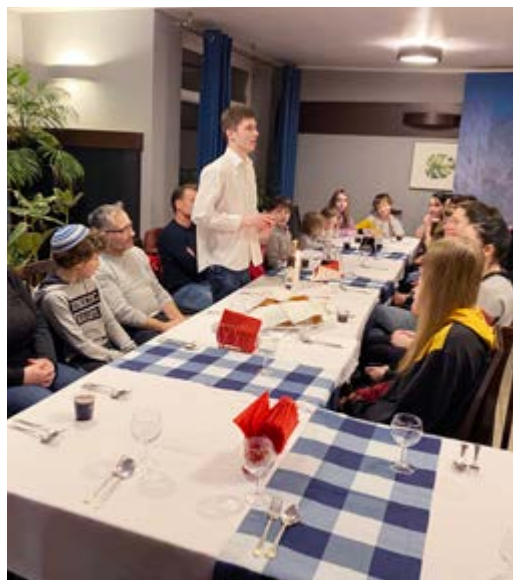
Left: Our base in Poland, where Jewish families can relax and celebrate Shabbat whilst they are with us.

Special operations rescued Jewish community groups in active war zones, snatching them out under missile and