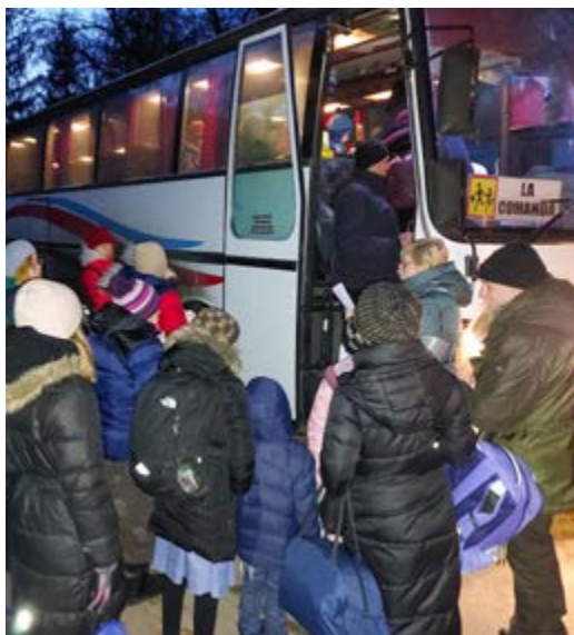
Left and right: Ukrainian Jews making aliyah from Moldova.