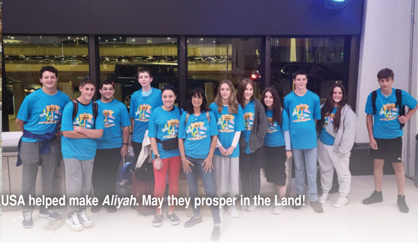
Photos of Olim OEUSA helped make Aliyah . May they prosper in the Land!