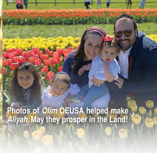
Photos of Olim OEUSA helped make Aliyah. May they prosper in the Land!