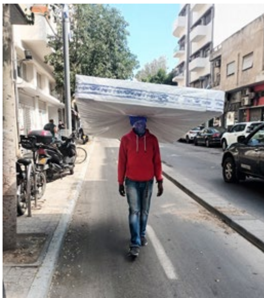
A novel way to deliver a mattress.

A divorcee in her 50s, she had come alone to Israel from Argentina. And now this! She had been diagnosed with a condition requiring lots of expensive medication and it prevented her from working. While she would eventually be supported by Israeli benefits, it would still take some months until she received them.