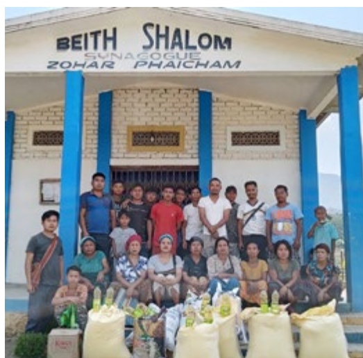
These synagogue congregations are among those who have been receiving aid.

At the beginning of May this year, an ethnic conflict between the Kukis and the Meiteis, the two communities living in Manipur, broke out without prior warning. There was a tribal solidarity march on 3 May, a protest by the Kuki and Naga communities against the Meitei-controlled state government's plans to dispossess them of their property. Once these homes came under the authority of the state, the Meiteis would be able to take control over Kuki homes in the hills, so during the Kuki-led peaceful march, they were violently attacked