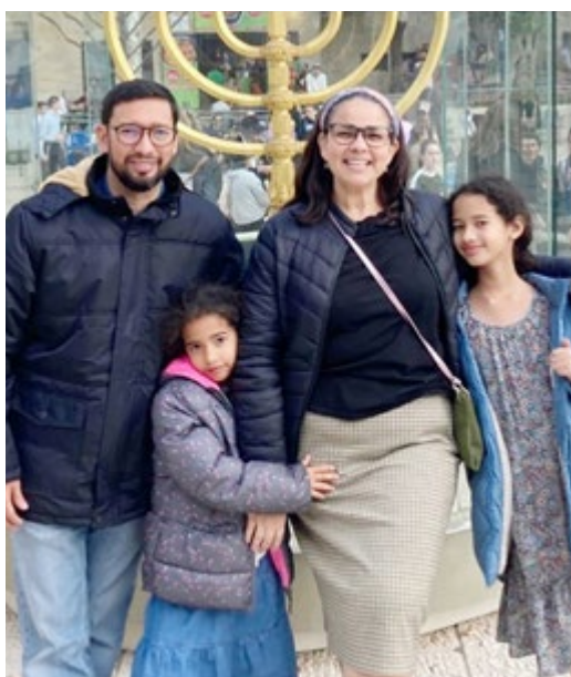
Right: Two families we have helped from Costa Rica.

This is the blessing on sowing given by the Lord for the opening of the paths of aliyah throughout Central America.