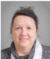
YANYA UKRAINE TEAM

In order to minister to Jewish people we drive thousands of kilometres, sometimes on very bad roads, and despite the dangerous situation in Ukraine. We look for Jewish refugees who have fled the hostilities and settled in more peaceful regions of the country. Although there is often no power in the houses we visit, we see the light of God, the light of hope, fill their hearts as we share with them.