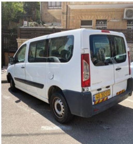
Top: EOE Israel's new minibus quickly proved its worth in helping olim.

Renting a vehicle for a day is prohibitively expensive. This vehicle fills a real need and will help us as we support families as they start their new life here in the Land.