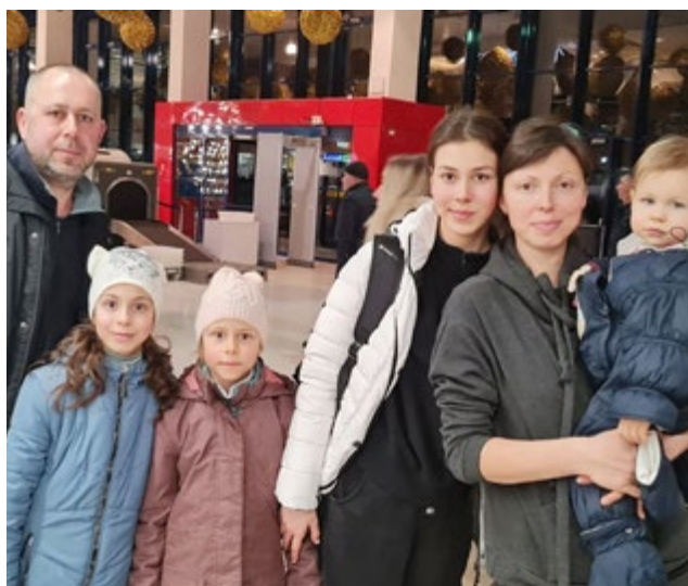
Left: A family of three generations from Russia, whom our Moldova team helped while they were applying for aliyah in Chisinau. They arrived in Israel in mid-February.