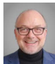
WINFRIED RUDLOFF GERMANY NATIONAL COORDINATOR