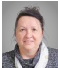
YANYA UKRAINE TEAM