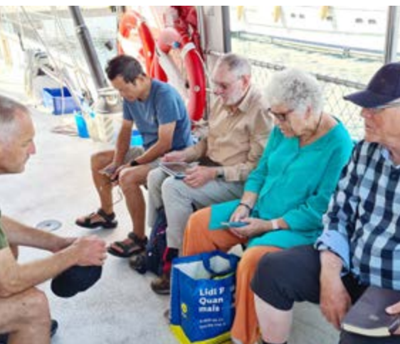
Bottom images, left to right: Praying near Gibraltar; the Elida in the harbour of Hönö, Sweden; crossing the English Channel