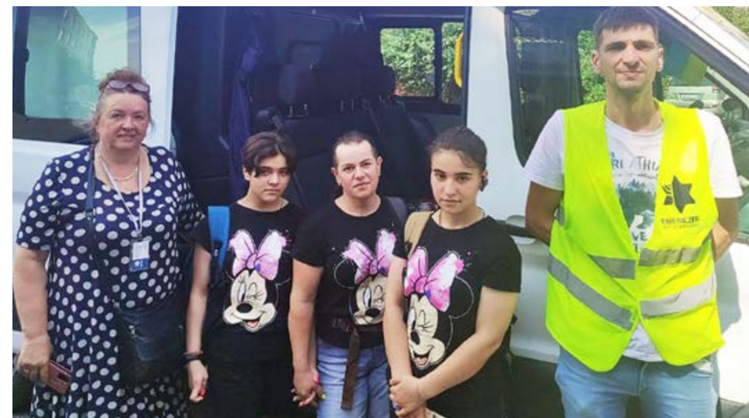
Top: Zion Gate – Jerusalem, Israel.

Please pray for obstacles hindering families from making aliyah to be removed.