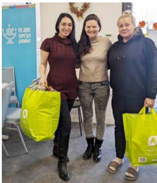
Top: Jewish Ukrainian families in Warsaw with the JDC.