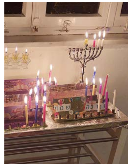
Top: Celebrating Hanukkah and Shabbat at Haifa House for Olim.