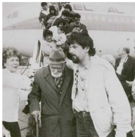
Right: Recent aliyah flight from France.